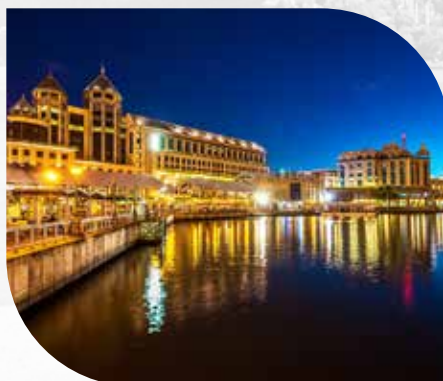
Port Louis & Pamplesmousses