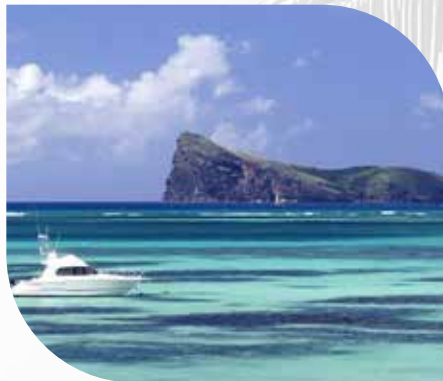
Flat Island & Gabriel island