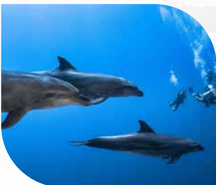
Swimming with Dolphins