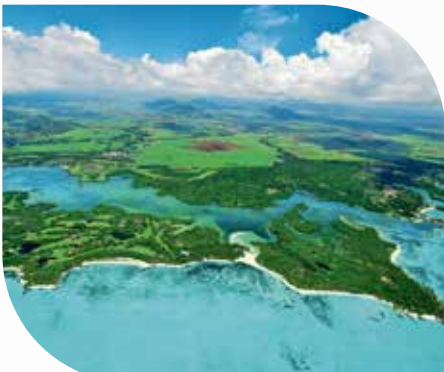
Ile aux Cerf

Make everyday a holiday the choice is yours